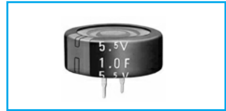
Marking color : White print on an indigo sleeve