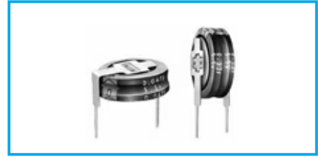
Marking color : White print on an indigo sleeve